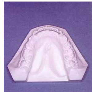
FIXED OR BONDED LOWER ONLY