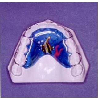
REMOVABLE (Hawley) UPPER or LOWER 6 mos full-time, 1 yr nights